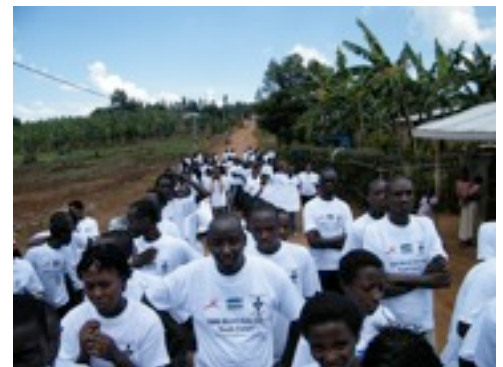
Above: Participants in the 2009 Youth Leadership Forum in Rwanda

Find information about HIV testing in your area! Check out: